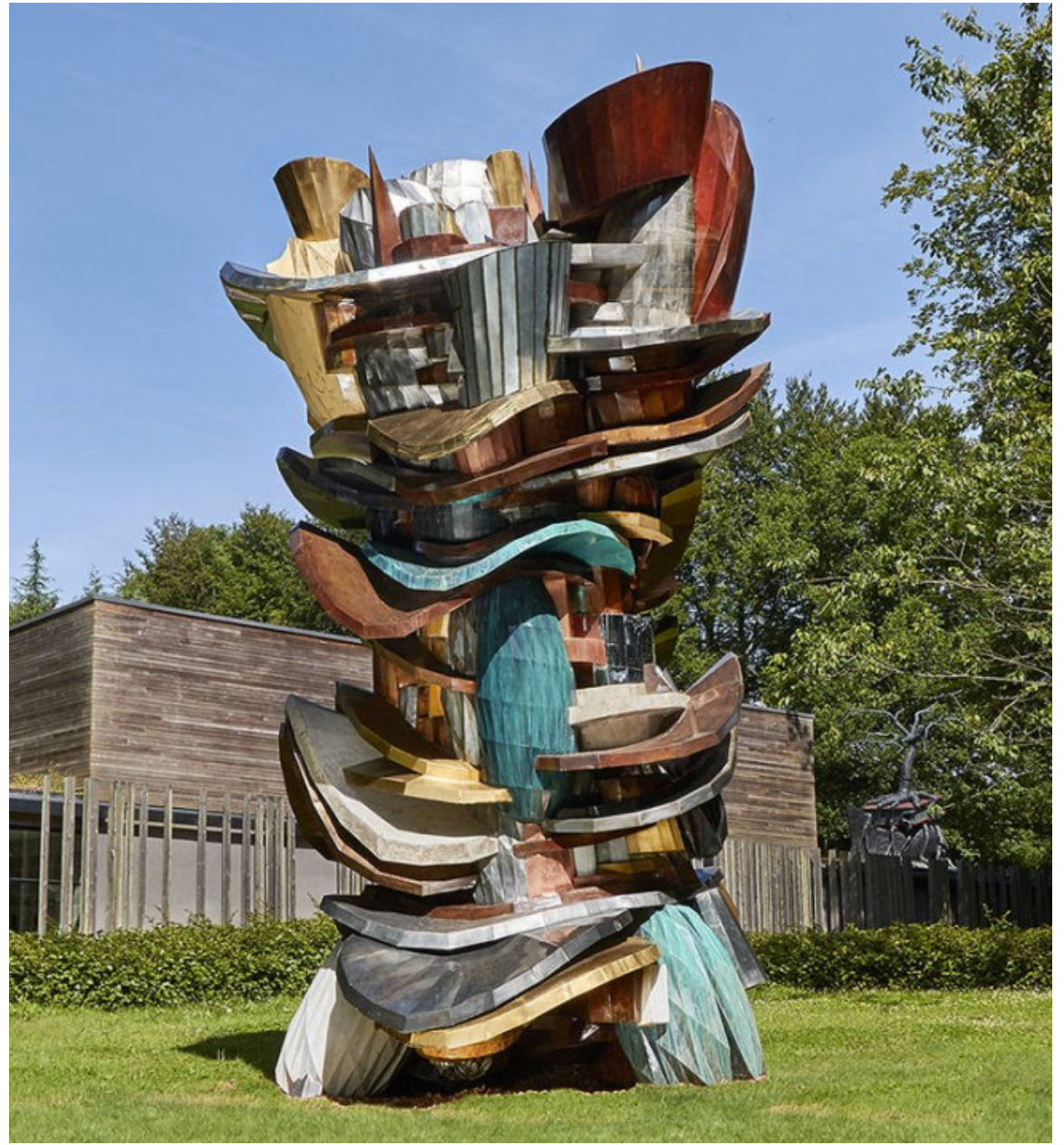
Wang Yuyang Untitled 1, 2016