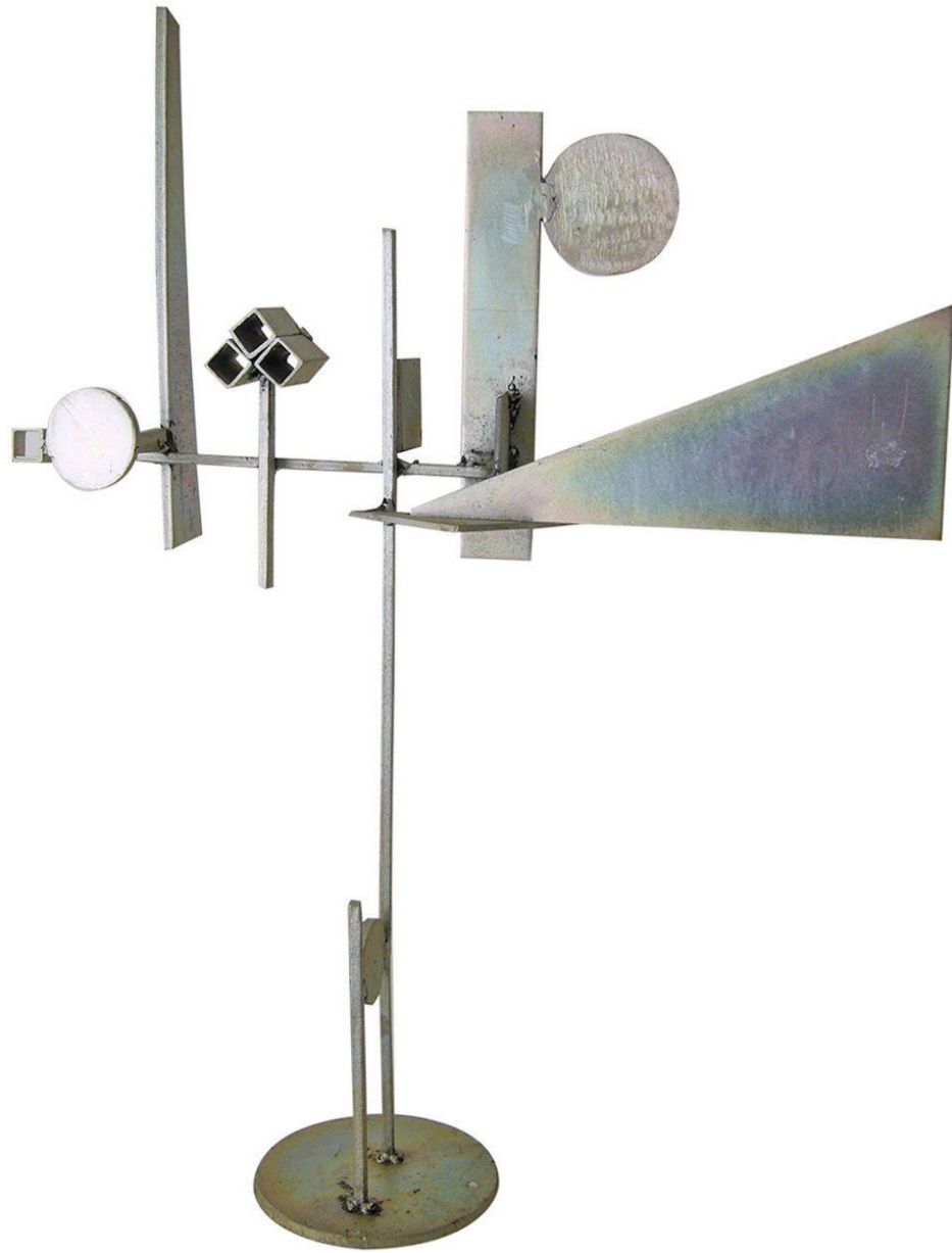
Paul Kasper Cadmium Plated Sculpture, 1959