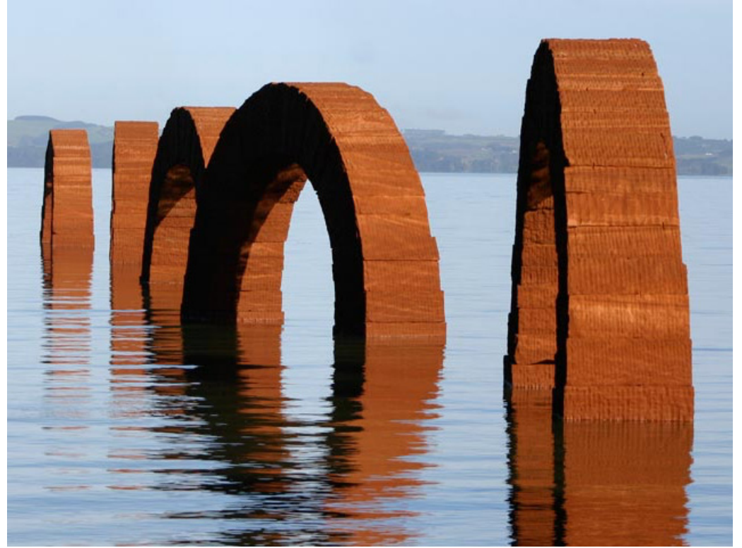
Andy Goldsworthy Arches