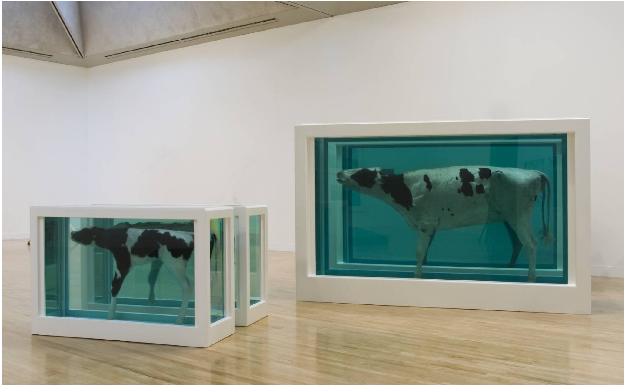
Damien Hirst Mother and Child (Divided), 1993