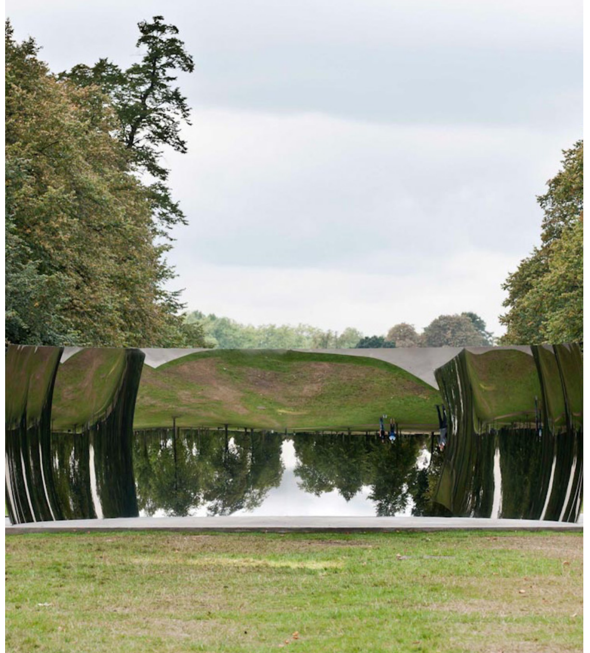
Anish Kapoor C-Curve, 2009