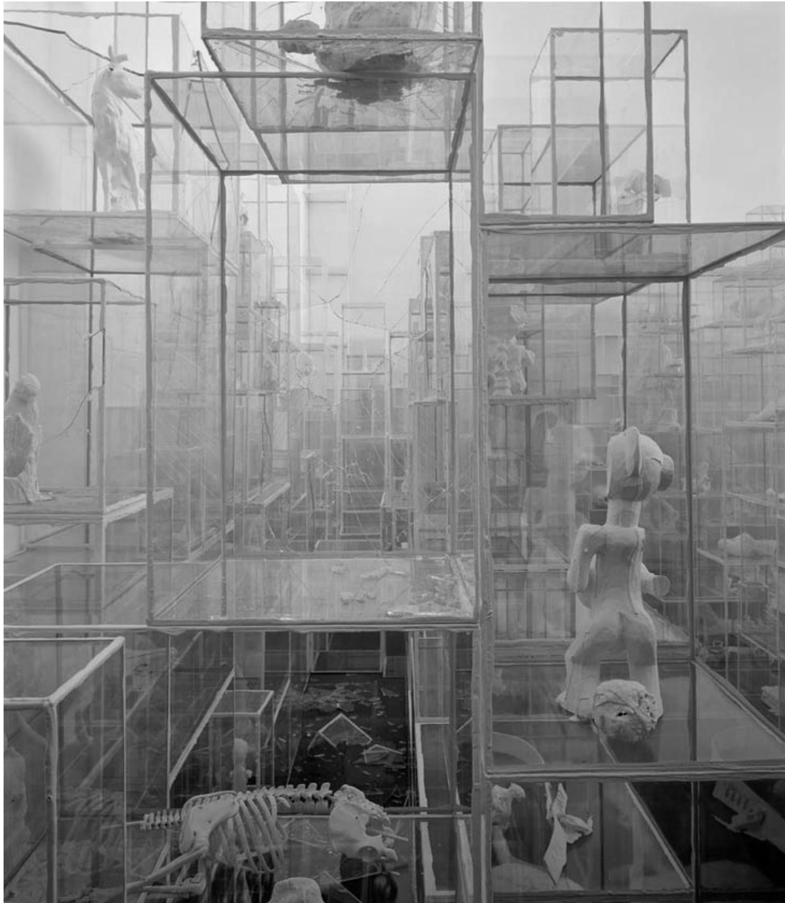
Terence Koh Untitled (Vitrines 5 - Secret Secrets)