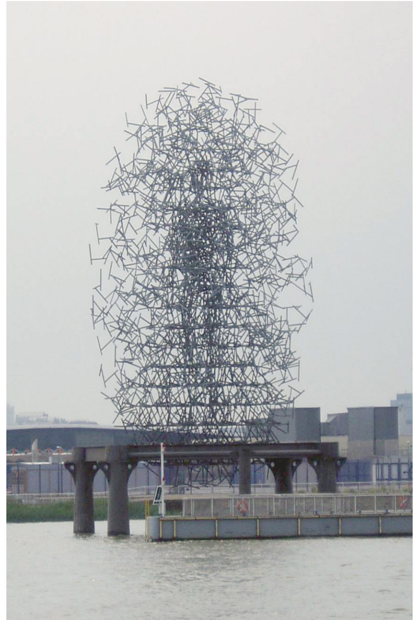
Antony Gormley, Quantum Cloud, 1999