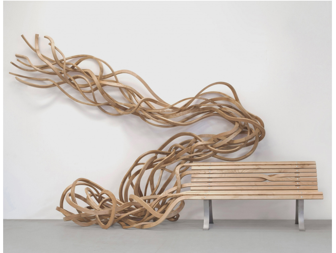
Pablo Reinoso The Spaghetti Bench, 2006