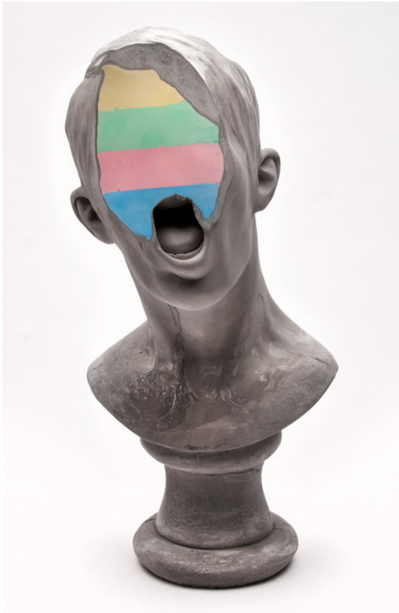
Christina West Unmet #9, 2015