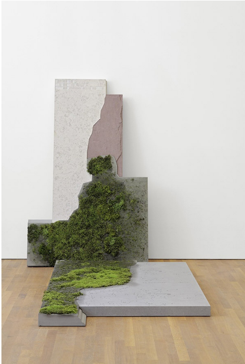
Paul Chan Tablet 3, 2014