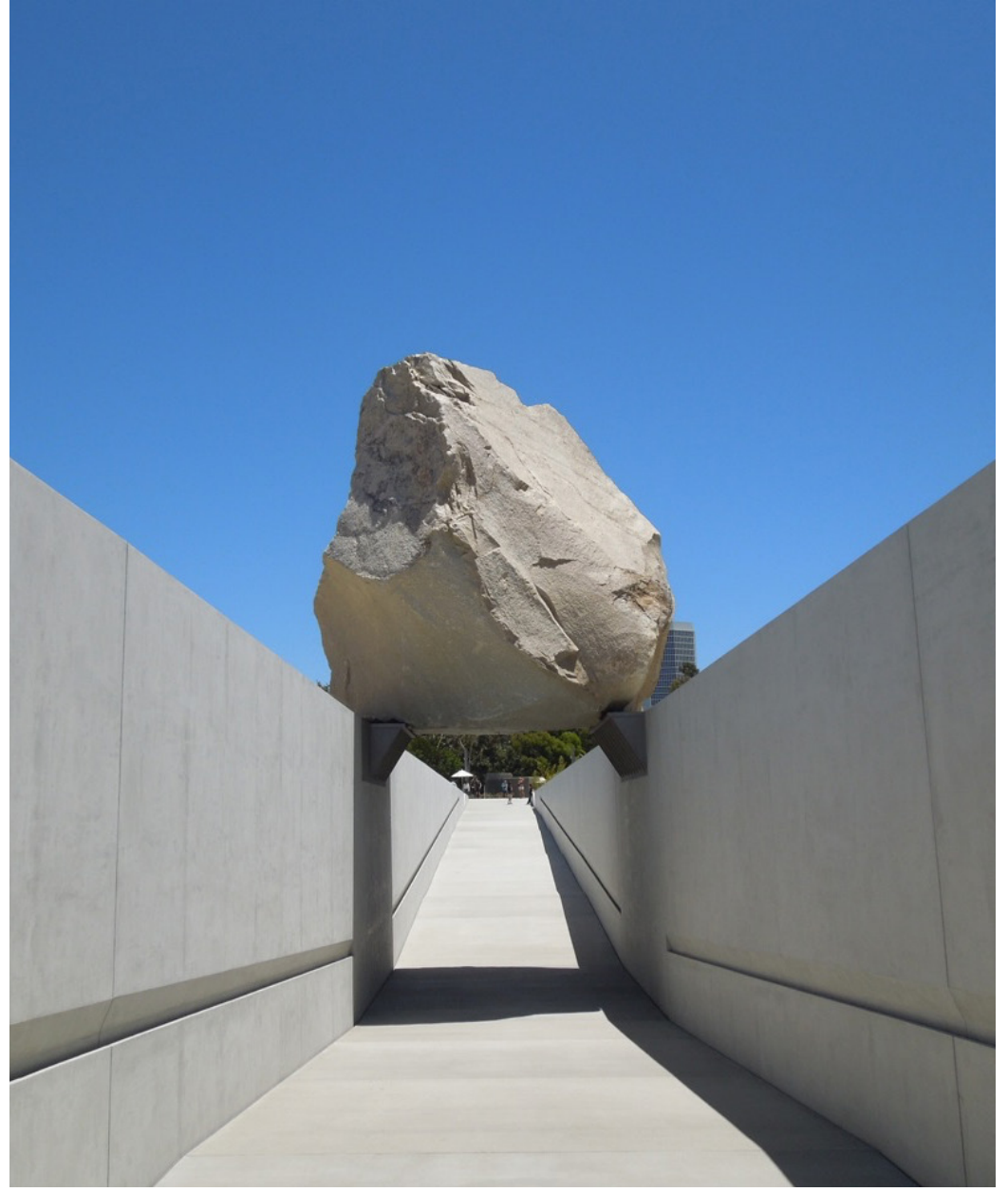
Michael Heizer Levitated Mass, 2012